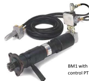
BM1 with hand control PT-15K

hand control gear flange type turning motor